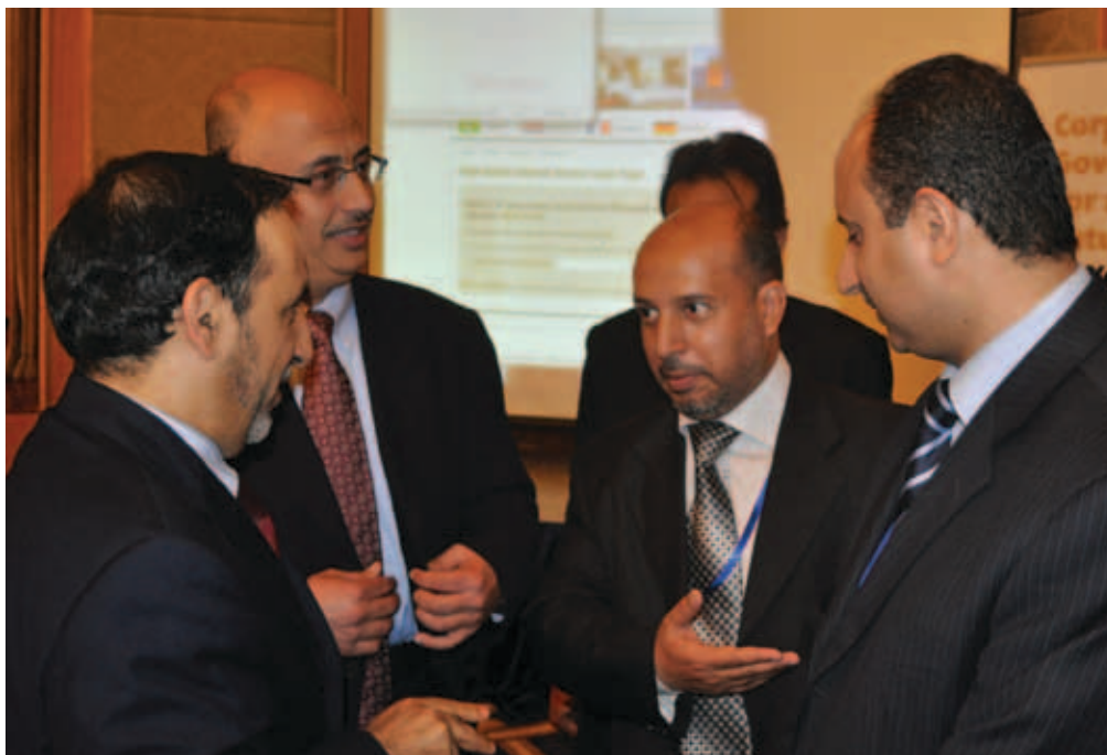
Launch of the Yemen Guidelines for Corporate Governance organized by the Yemeni Businessmen Club and CIPE, March 2010.

constructive debates tends to be difficult if the board exceeds 12 directors, and smaller boards tend to be more effective and productive. The key is to find the most effective balance while still keeping in mind legal requirements. 35 In most developed countries with dispersed ownership, boards average seven to 11 members.