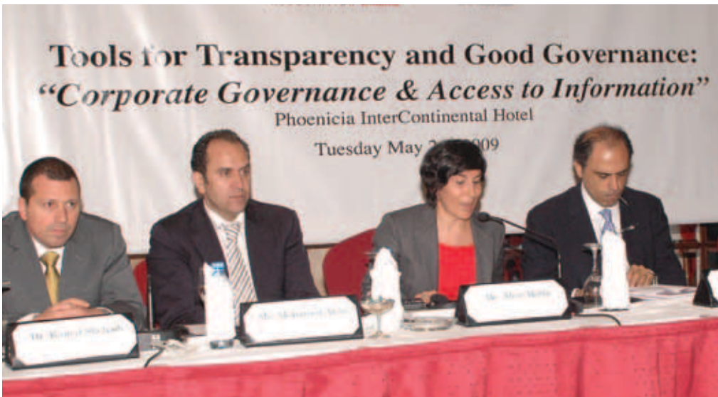
Event in Beirut to launch the corporate governance guidebook for family-owned enterprises and listed companies developed by the Lebanese Transparency Association, May 2009.

Nearly 80 percent of the company’s case load can now be resolved by employees with few