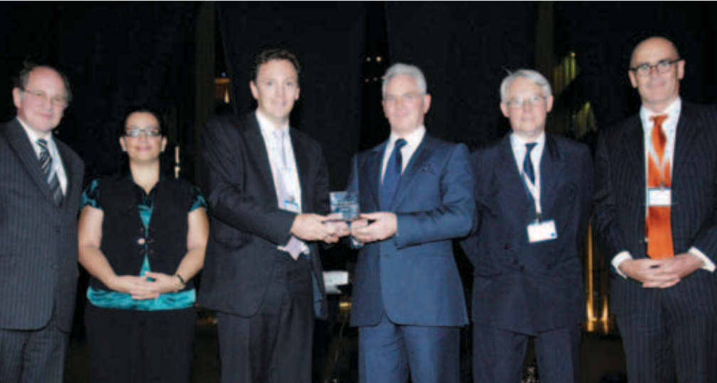
The Abu Dhabi Commercial Bank wins a "2009 Bank Corporate Governance Award" from the Hawkamah Institute of Corporate Governance in November 2009.

well as brokerage and asset management services through a network of some 49 branches in the UAE and India. It also holds 25 percent of Malaysian banking group RHB Capital.