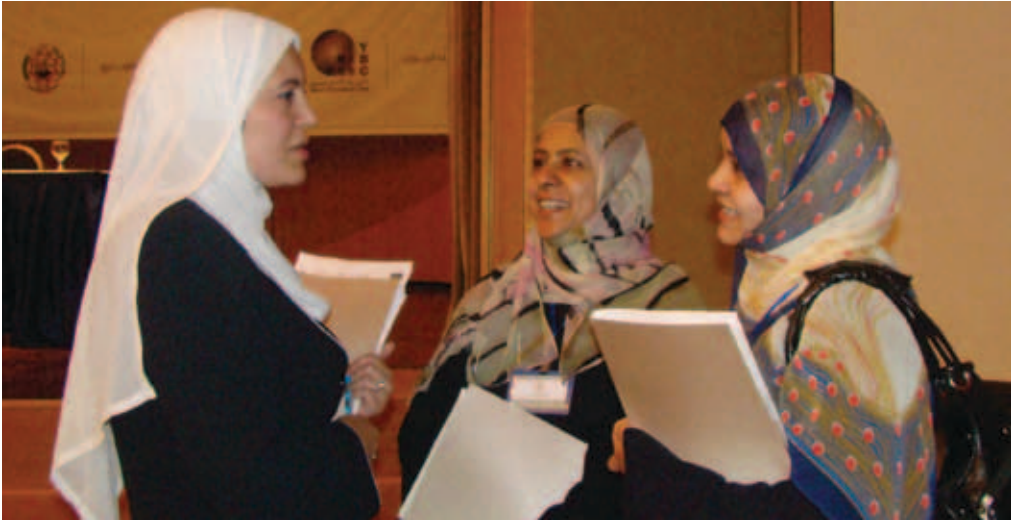
Participants in a corporate governance training-of-trainers program in Sana'a, Yemen, June 2010 conducted by the IFC and CIPE.

accepted in the market. As evidenced in many of the case studies, when there has been a need for capital, companies in the region have provided the requisite information. That trend is likely to quickly become more widespread.