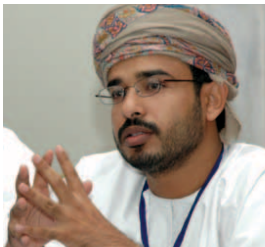
Participant from a workshop on creating a corporate governance task force in Oman facilitated by CIPE, February 2008.

The chairman is in charge of running meetings in an efficient manner. Meeting procedures and agenda-setting should be developed as board guidelines. The following example illustrates a typical structure for board meetings: