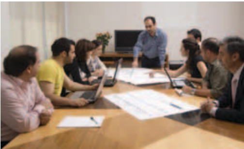
Butec engineering team meets to discuss financial transactions.

Butec was able to take advantage of one of its joint-venture projects with a key French partner to help develop its internal audit capability. Butec personnel joined a team of established professionals in evaluating processes implemented in the execution of the project's contractual obligations. They participated in creating and carrying out audit plans on site and in field offices, thereby becoming active