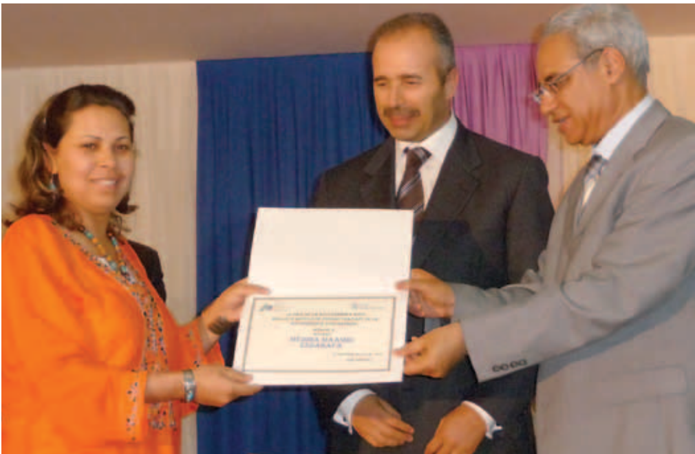
Tunisian journalist receives award for best corporate governance article in 2009, at an event hosted by L'Institut Arabe des Chefs d'Entreprises (IACE), a business association in Tunisia.

The board must be clear in defining what information it finds useful for decision-making. Many boards have begun to use key performance indicators that include both financial performance, as well as other data that may be more forward-looking, including satisfaction of clients, employee