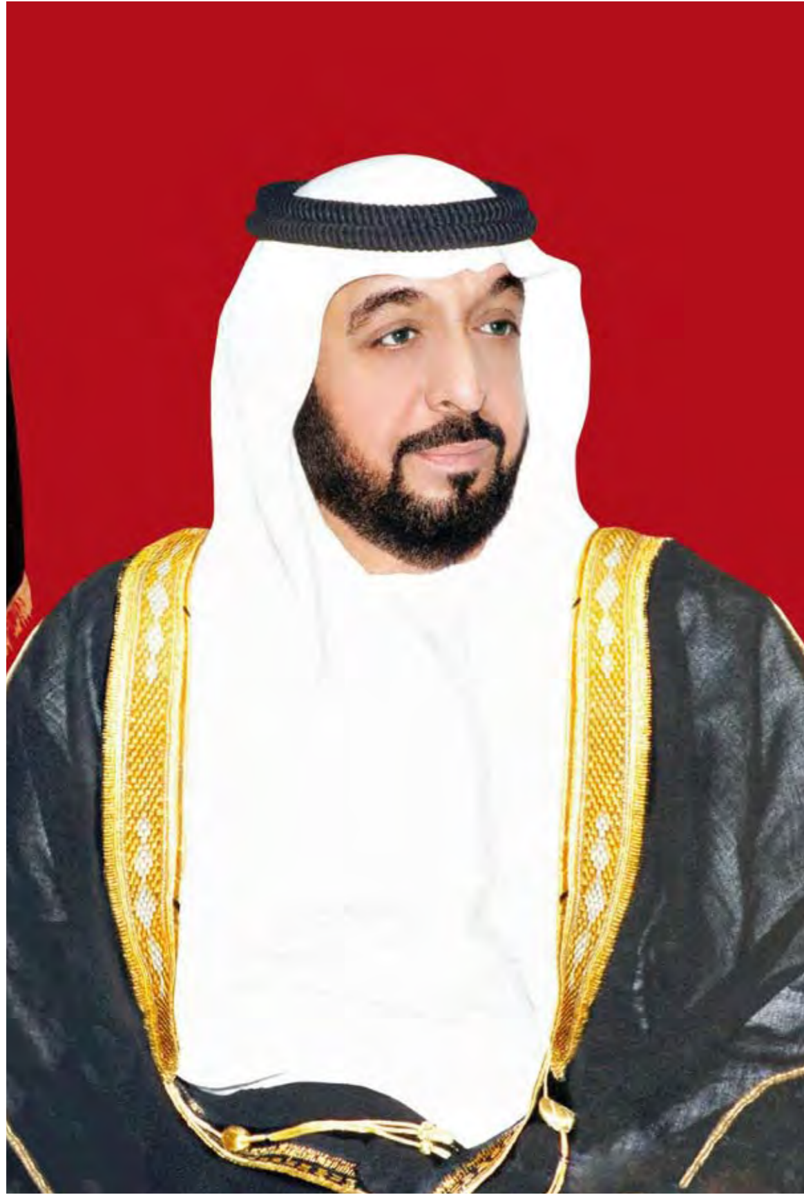
H.H. Sheikh Khalifa Bin Zayed Al Nahyan President of the U.A.E.