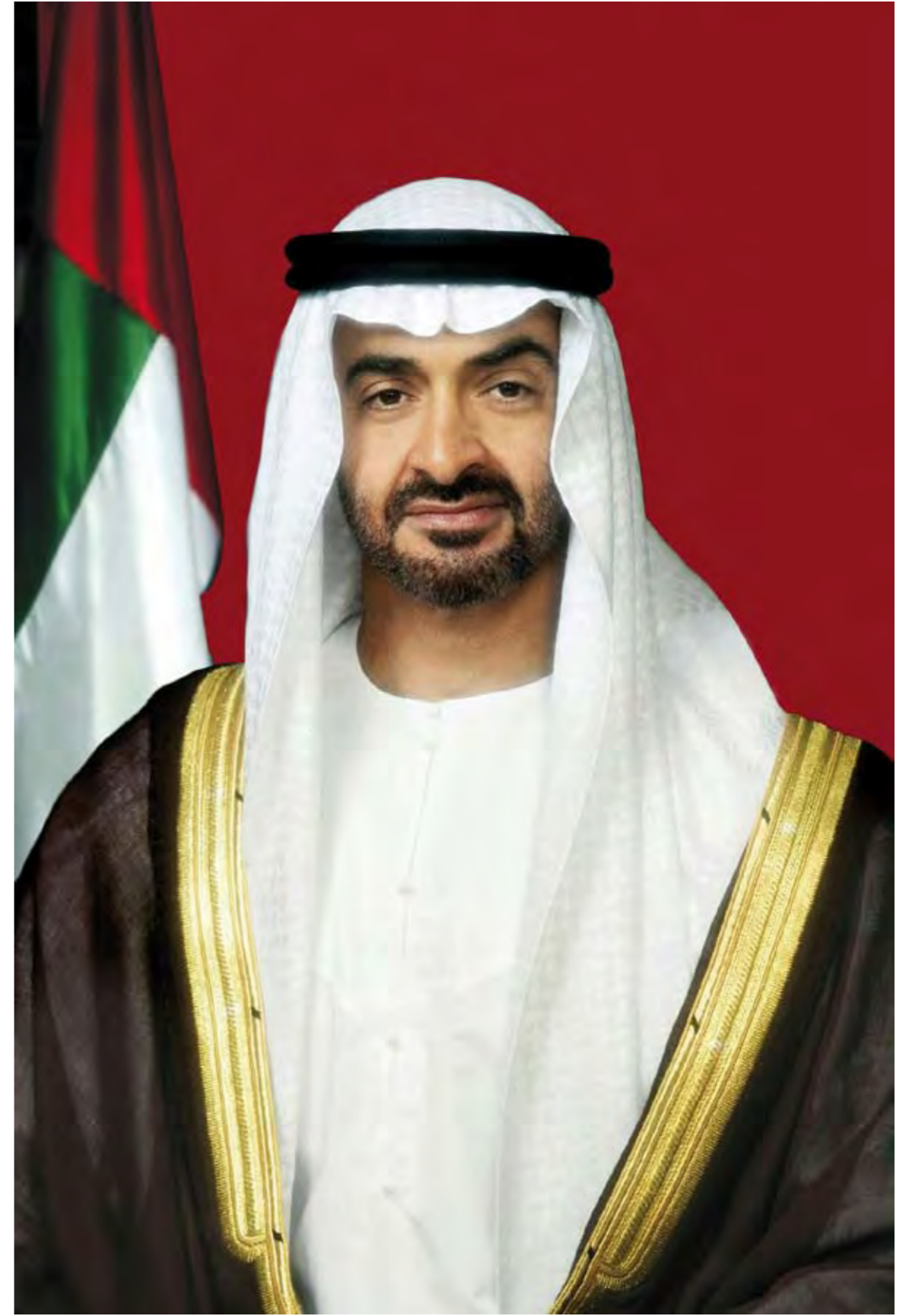
H.H. Sheikh Mohammad Bin Zayed Al Nahyan Crown Prince of Abu Dhabi